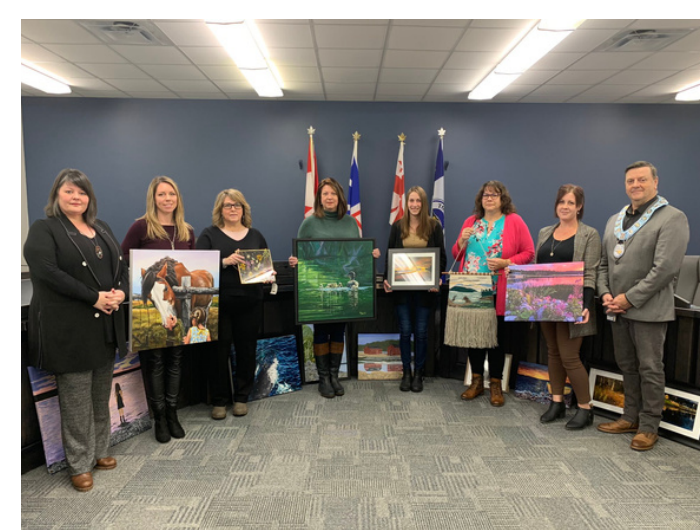
These artworks will be displayed in the lobby of the Town Hall during 2023.