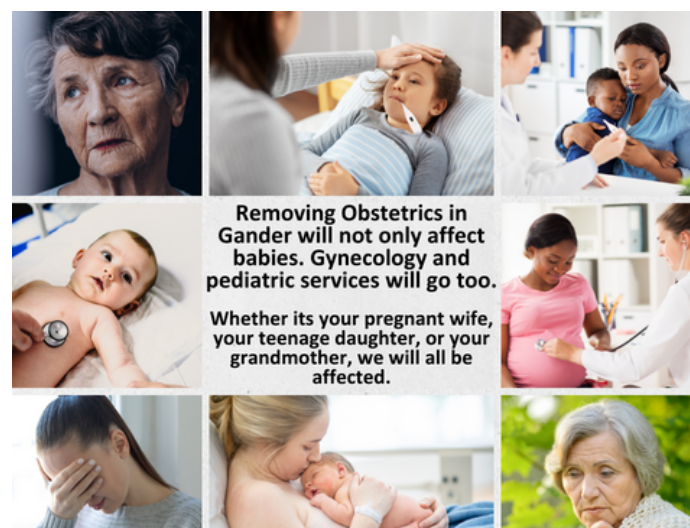
Removing Obstetrics in Gander will not only affect babies. Gynecology and pediatric services will go too.